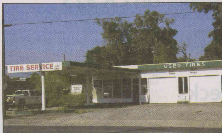
Old Tire Store before Sept. 2.