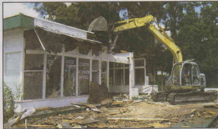
Hungry demolition equipment chomps down on old station last week in Chiefland.